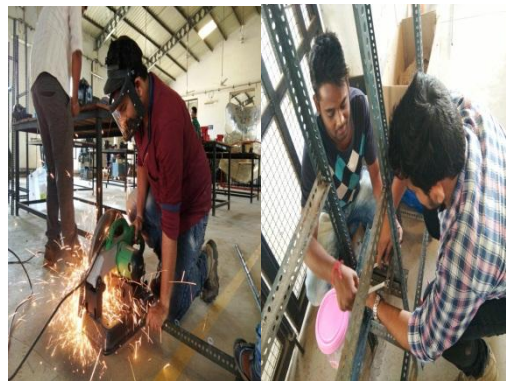
Fig Cutting and assembling of the setup parts (workshop)

We will have a packing of bed in the settle tank, and will take a granules of different sizes and having plastic coating on it to protect from sticking of granules or to avoid growth of culture on it.