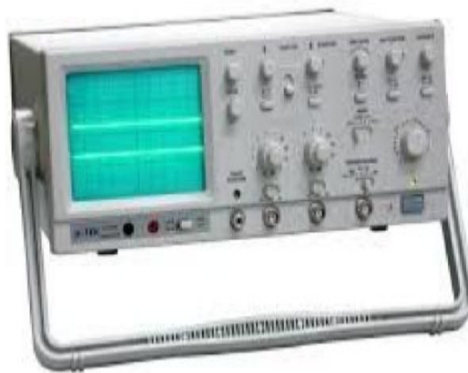
Fig 1: general cathode ray oscilloscope

we can see now a days there are large size oscilloscope are use in which we see different waveforms and measure the frequency, Time etc, in a lab only ,Which Consumes a Lot of time and money.[1] so we can implement this project using Android...! Portable oscilloscopes in the market are very expensive, less power efficient This paper presents the design and implementation of a low cost, portable, light-weight, low power, single-channel oscilloscope, consisting of a hardware device and a software application. The device is equipped with raspberry pi3 model B.[2] which consist a Bluetooth module to provide connectivity to a device with Bluetooth, running the Android operating system (OS), in order to display the waveforms. Android OS is selected because there are a more number of Android device users and most of these devices satisfy the requirements of the oscilloscopes software application. The Software application developed for Android receives the data transmitted from the hardware device and plots the waveform according to the display settings configured by the user. These display configurations are transmitted to the hardware device once they are set by the user, and are used by the hardware device to set the sampling rate and the values of samples.