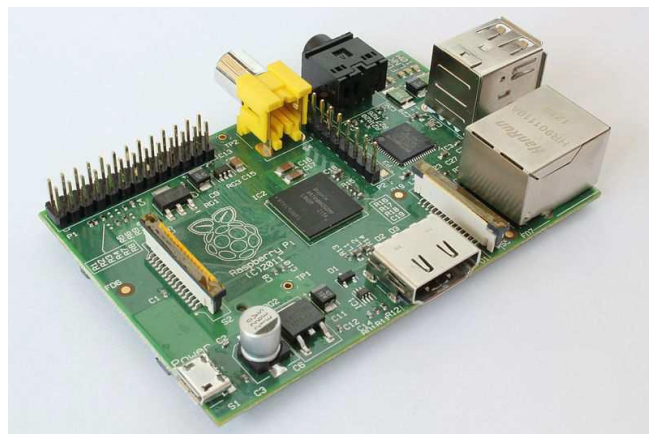
FIG 3: RASPBERRY PI 3 MODULE B

Block Diagram Explanation: in this block diagram we give the signal to the ADC IC which is (MCP3008).this mcp IC has 4 pins that is MIMO(Multiple Input Multiple Output), MISO(Multiple Input Single Output), CS(Chip Select), CLK(Clock). this 4 pins are connected to raspberry pi. Raspberry pi has 40 GPIO pins. but out of which we required only 4 pins to connected this signal i.e.(pin no.19 is use for MOSI, pin no. 21 is use for MISO, pin no.23 is use for CLK and pin no.24 is use for CS).Raspberry pi has inbuilt Bluetooth module, therefore we can transmit the waveform through this Bluetooth module. which is already present in android phone. therefore instead of using very large size of oscilloscope we can use android phone so with the help of android application we can transmit or receive the signal through the wireless Bluetooth. and as we know the now a days the growth of android phone is rapidly increases so its easily available and the main things is that it support the hardware. Therefore we can connect the Raspberry pi very easily to the android phone.