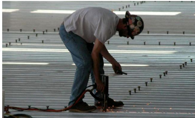
Fig. 2 Install shear connector