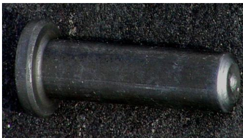
Fig. 3 Shear connector