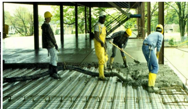
Fig. 4 Installation of concrete

Shear connectors are steel elements such as studs, bars, spiral or another similar devices welded to the top flange of the steel section and intended to transmit the horizontal shear between the steel section and the cast in-situ concrete and also to prevent vertical separation at the interface.