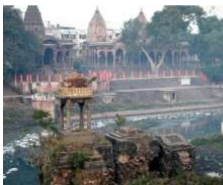
Figure 1: Pollution in khan river