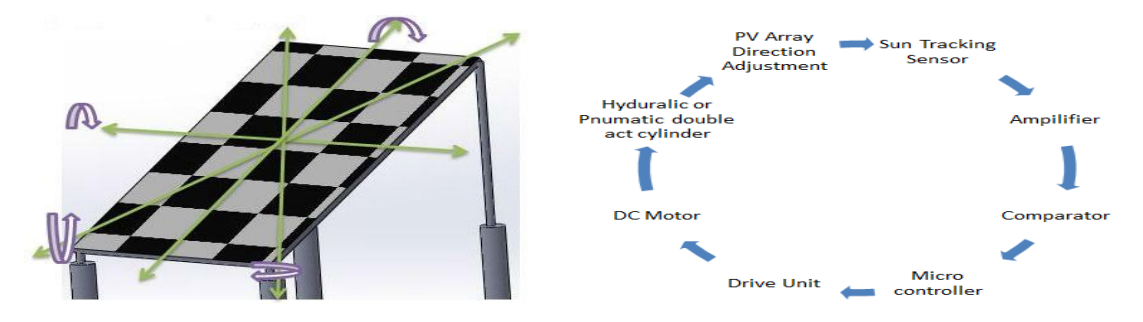
Fig2: Tracking mechanism (a) four-axis (b) block diagram [17]