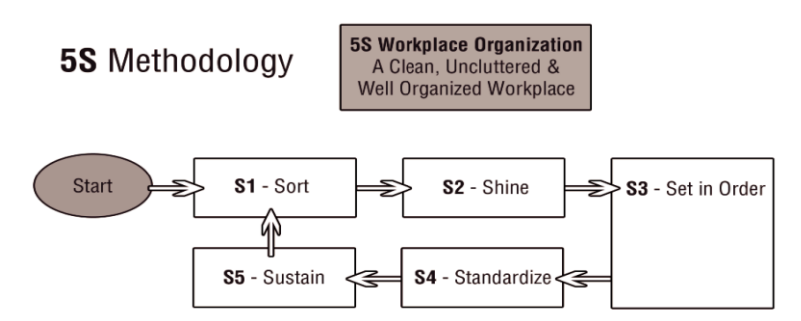
Fig 1.1: 5s Methodology

5S is one of the most widely adopted techniques from the lean manufacturing toolbox. Along with Standard Work and Total Productive Maintenance, 5S is considered a "foundational" lean concept, as it establishes the operational stability required for making and sustaining continuous improvements.