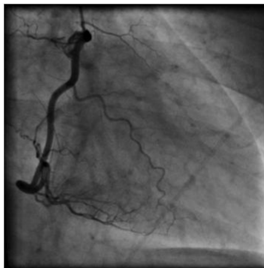
Figure 1 clinical angiogram

Angiography is the gold standard technique used to evaluate abnormalities or at deposition occurred in blood vessels, providing images with good spatial and temporal resolution. In digital images, the image processing filtration techniques can be easily used. The simplest methods