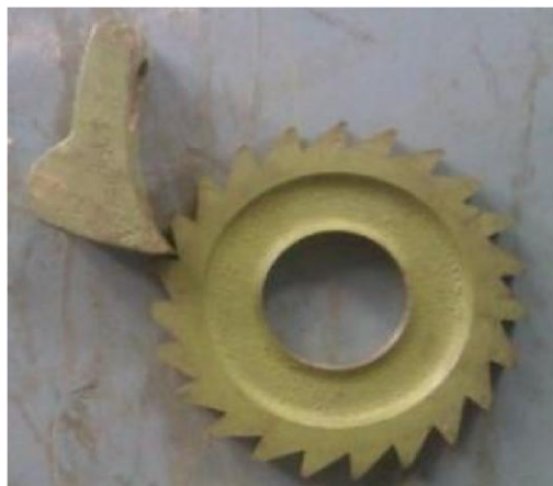
FIGURE 2: FABRICATED RATCHET AND PAWL MECHANISM

The new ratchet-pawl assembly is made by authentic design parameters and it can withstand on high bending stress due to its capacity of bending stress 225.55 M Pa. As shown in figure the ratchet-pawl is new designed for anti roll back system. The design is safer than conventional design.